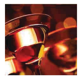
Table-side wine service during lunch/dinner is available, charged by consumption